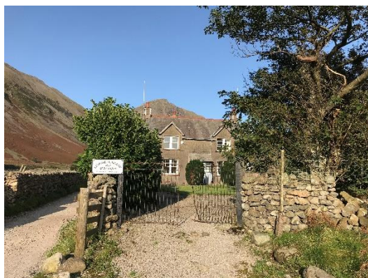
Lingmell House B&B

All the above are located at the head of the valley and close to the start point.